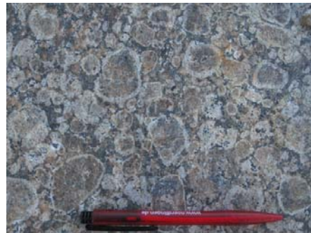
Figure 4: Personal field team photograph of granodiorite, showing beautiful potassium feldspar phenocrysts with reaction rims. The mission control team discovered a 'fresh', clean surface.

bot-driven planetary exploration, since personal experience with Earth analogues cannot be relied upon when extraterrestrial features may have vastly different scales. One solution is to use scale bars on all visual data; however, it is not clear how this will work for distant features. A similar problem exists for determining relief remotely. In this case, stereo was not completely effective unless stereo pairs were collected from several look directions, effectively forcing the robot to mimic the behaviour of a typical field geologist. Increased resolution of the cameras and better use of lidar data may address this issue. Issues of missed geologic details are a purely operational problem. All these factors are compounded by time constraints.