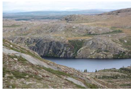
Figure 5: Personal field team photograph of geology across the Mistastin River.

It is important to be aware of these geo-focused situational awareness issues in planetary missions, so that operations can be planned accordingly.