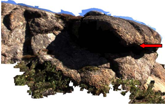
Figure 3: Data from the mSM stereo camera. Additional data from other angles would have shown that the top rock (red arrow) overhangs the underlying rocks by significantly more than is apparent here.

reo camera [3] in the instrument package. However, our team found that even stereo data (Fig. 3) did not always solve the problem. First, proper relief was often not represented, because the stereo data was collected from one location. For best results, additional stereo pairs from vastly different angles of observation should be acquired. Secondly, the spatial resolution of the mSM images (1280x960 - 1 Megapixel) was not sufficient to distinguish relief at the cm scale. A flat area 1 cm square in size was required to obtain X-ray fluorescence (XRF) spectrometer measurements. The mission control team's difficulty in determining relief certainly affected the collection of good quality XRF data.